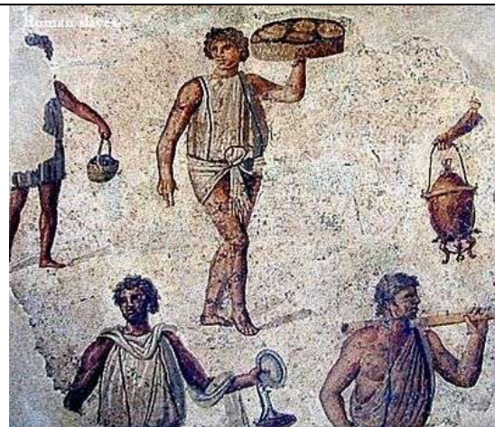
Roman mosaic with slaves

Even the fabled Roman baths were often run down and there is the question of how frequently the water was changed. Examination of human remains suggests that general health was poor with rotten gums and weak teeth, bone degeneration, arthritis and malnutrition. Clothes were expensive and had a real value, so that they would be included in an inheritance and were washed using a mix of ash and urine. It costs money to be buried so the poor were probably just dumped. Infectious disease was the major cause of death and had no respect for wealth. This high mortality resulted in a fragile society almost 50% of all children died before their 5 th birthday and half the population were under 20 years of age.