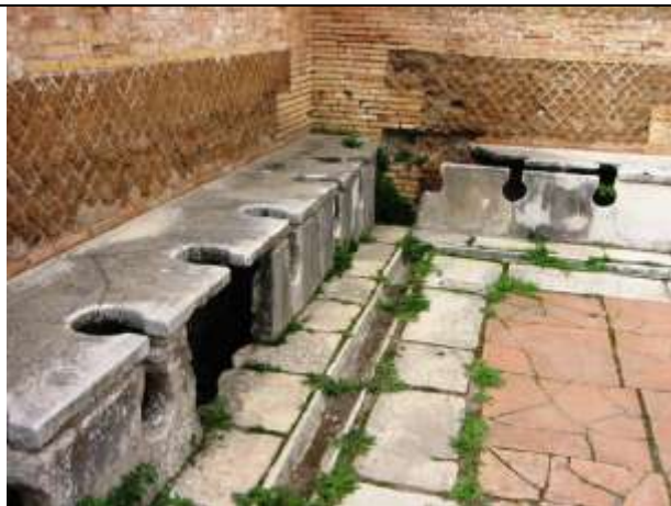
Ostia public toilets

Geoff then went to consider what the Romans were actually like. Although Rome had been transformed by Augustus after the chaos of the period of four emperors 68-69AD people still lived in very crowded conditions and Rome was very violent by our standards. Augustus set up urban cohorts of about 1500 men to combat mobs and violent gangs and the paramilitary vigilis of about 4000 men who were firemen and a night watch. He reminded us that women weren't even citizens. The empire was designed to preserve the privileges of the elite. There was huge social inequality that became worse with time and over half the population was on the edge of starvation. Violence was a part of life, whether the crucifixion of 6000 slaves along the Appian Way in 71BC after the defeat of the Spartacus revolt or the casual massacre of anybody who resisted conquest and this included every live creature in Carthage in 210BC. And of course we have the coliseum, the recreational choice for the average Roman, where they could enjoy watching indiscriminate slaughter for fun. And as for their personal habits they did not have the same concepts of privacy, which is a modern concept something invented in the 18 th or 19 th century.